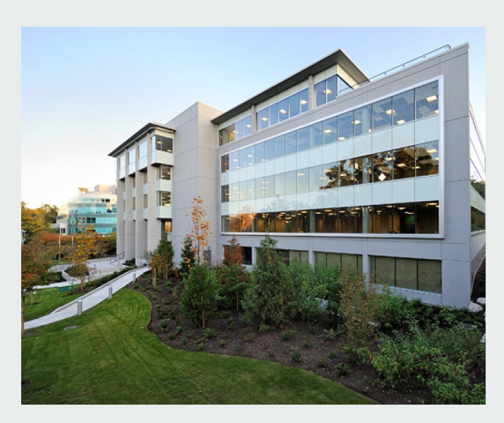
Discovery Park, UBC

By bringing together these various elements, Cleantech Commons provides the university community and our region with the opportunity to take advantage of opportunities in an emerging sector that is projected to be worth as much as $26 trillion by 2030 – while helping us all live more sustainably.