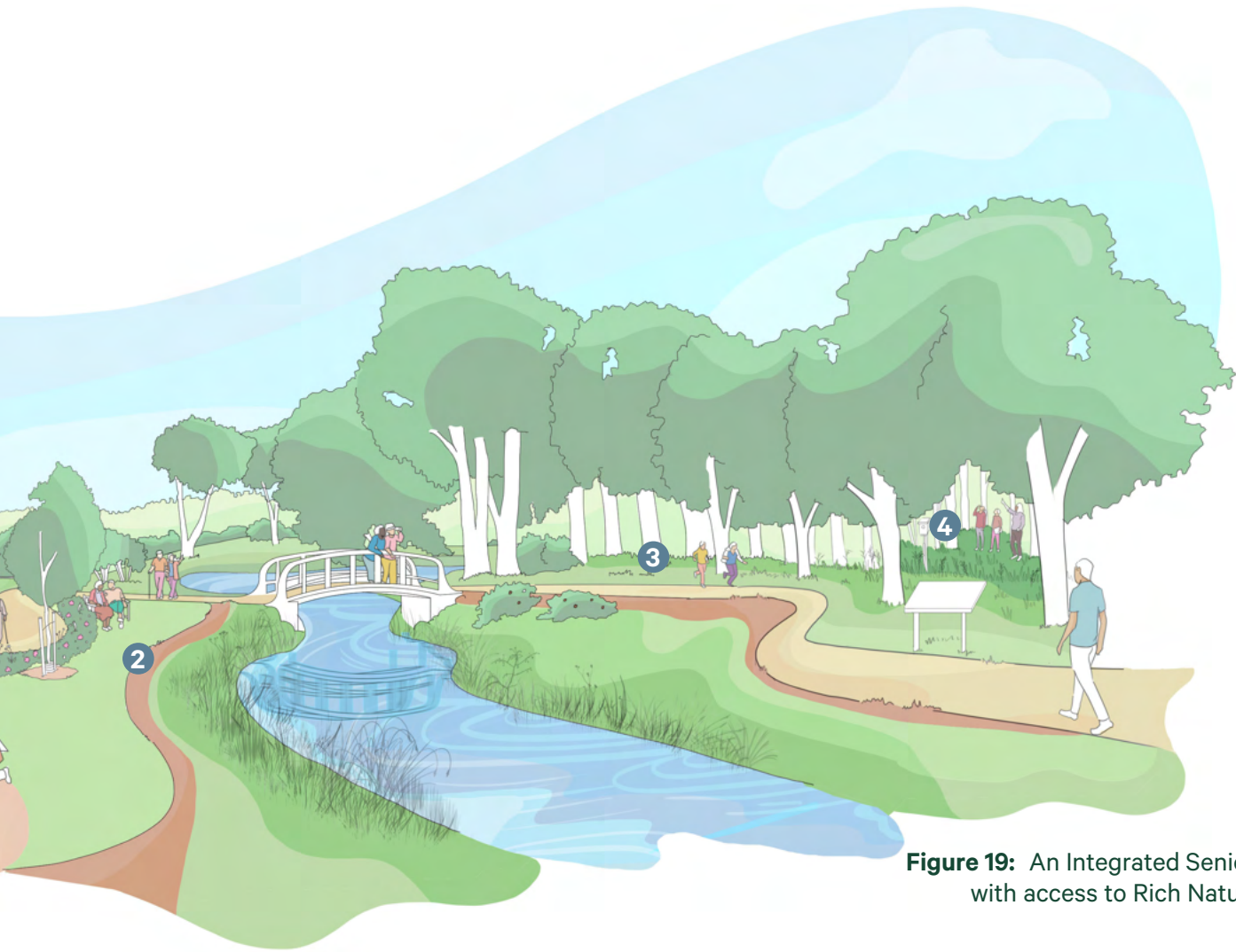
Figure 19: An Integrated Seniors Village with access to Rich Natural Assets