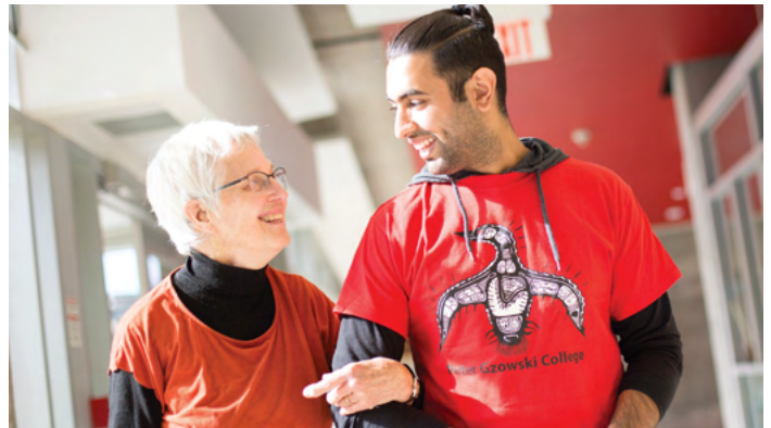
Trent Centre for Aging and Society, Trent University

The engagement of senior citizens will enrich the lives of students, alumni, retirees, and the larger community through areas of collaboration such as, hands-on learning and applied research programs, or guest lecturers. The Seniors Village should address the diverse spectrum of goals of academia as well as support the aging population.