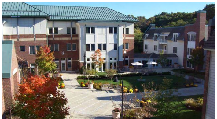
Retirement Housing Courtyard at Lasell Village for Lasell College.