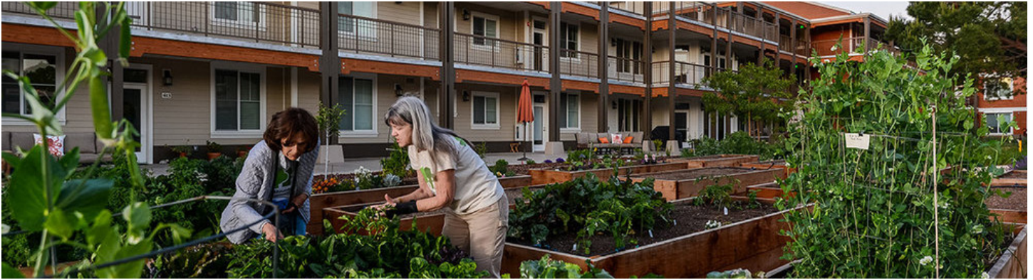
Valley View Senior Housing, American Canyon, California.