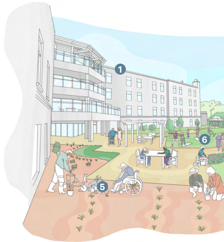
1 Learning and interaction with students