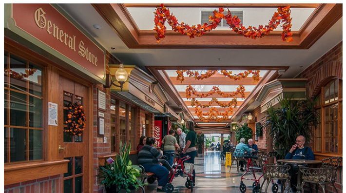
University of Waterloo Long-Term Care Facility with Indoor "Main Street", University of Waterloo.